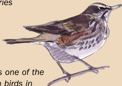
The redwing is one of the most common birds in the winter countryside