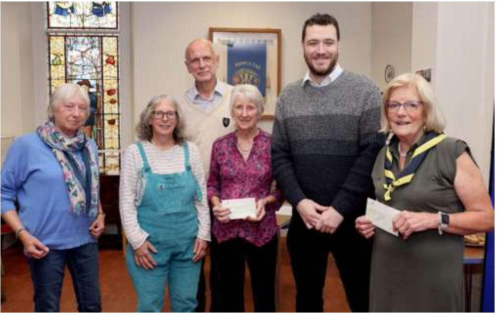
SCATA celebrates its 10th anniversary of winning the 'Best Partnership in Affordable Housing' award